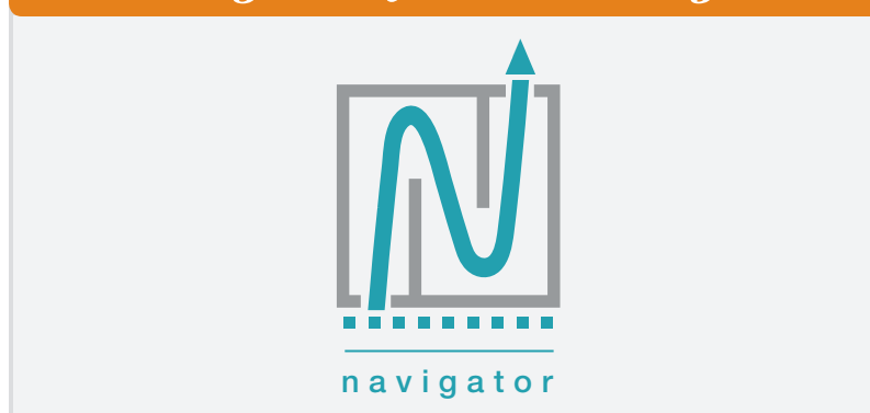
The new Surgical Quality Improvement Plan (SQIP) Navigator tool has launched this month, simplifying and standardizing the SQIP creation process.