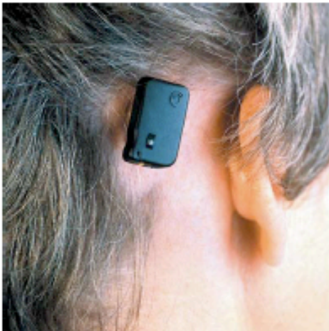
Figure 4* Sound Processor of BAHA attached.