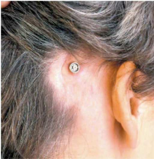
Figure 3* Skin penetrating abutment of BAHA