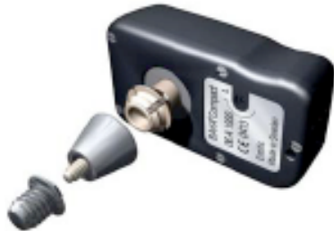
Figure 1* Sound Processor of BAHA